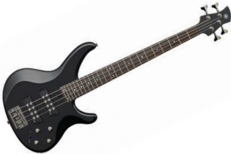
1 Yamaha RBX174 electric bass