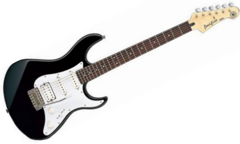
2 x Yamaha Pacifica 012 electric guitars