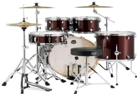
Mapex Storm drum kit