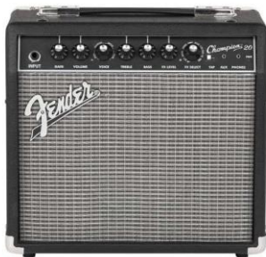
2 x Fender Champion 20 guitar amplifiers